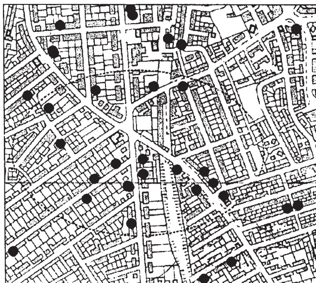
FIG. 2 Locations where more than one burglary took place over the study period have been isolated. © Crown copyright. ED 273554