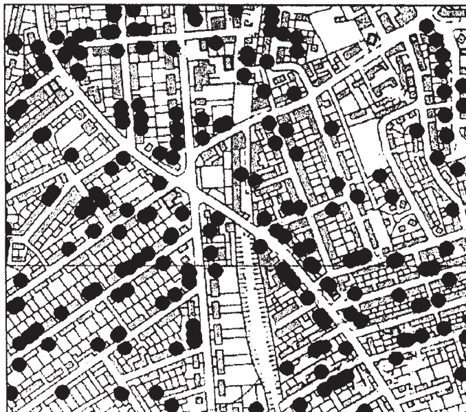
FIG. 1 Detail of the study area. The symbols indicate locations which were burgled from the period April 1995 to April 1997. © Crown copyright. ED 273554